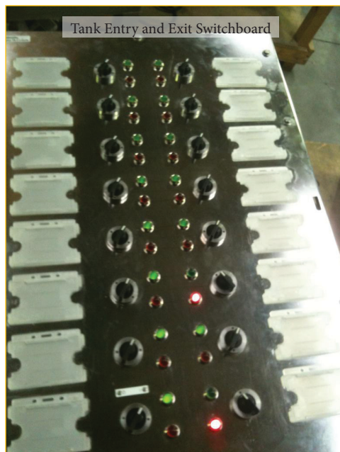
Tank Entry and Exit Switchboard

The display board is battery backed up so that in the event of power failure, the last screen